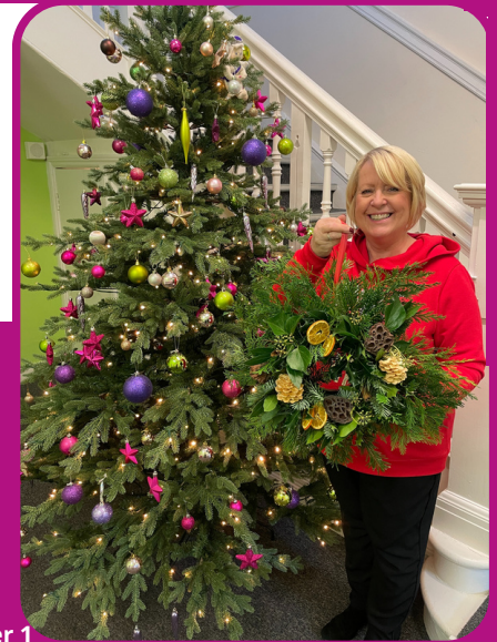
Issue number 1